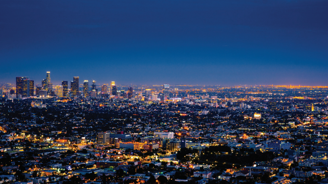
Los Angeles at night