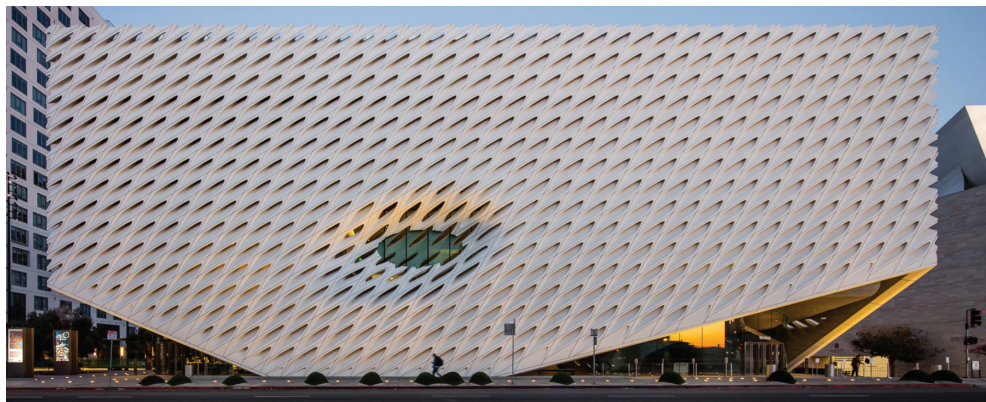
The Broad Museum