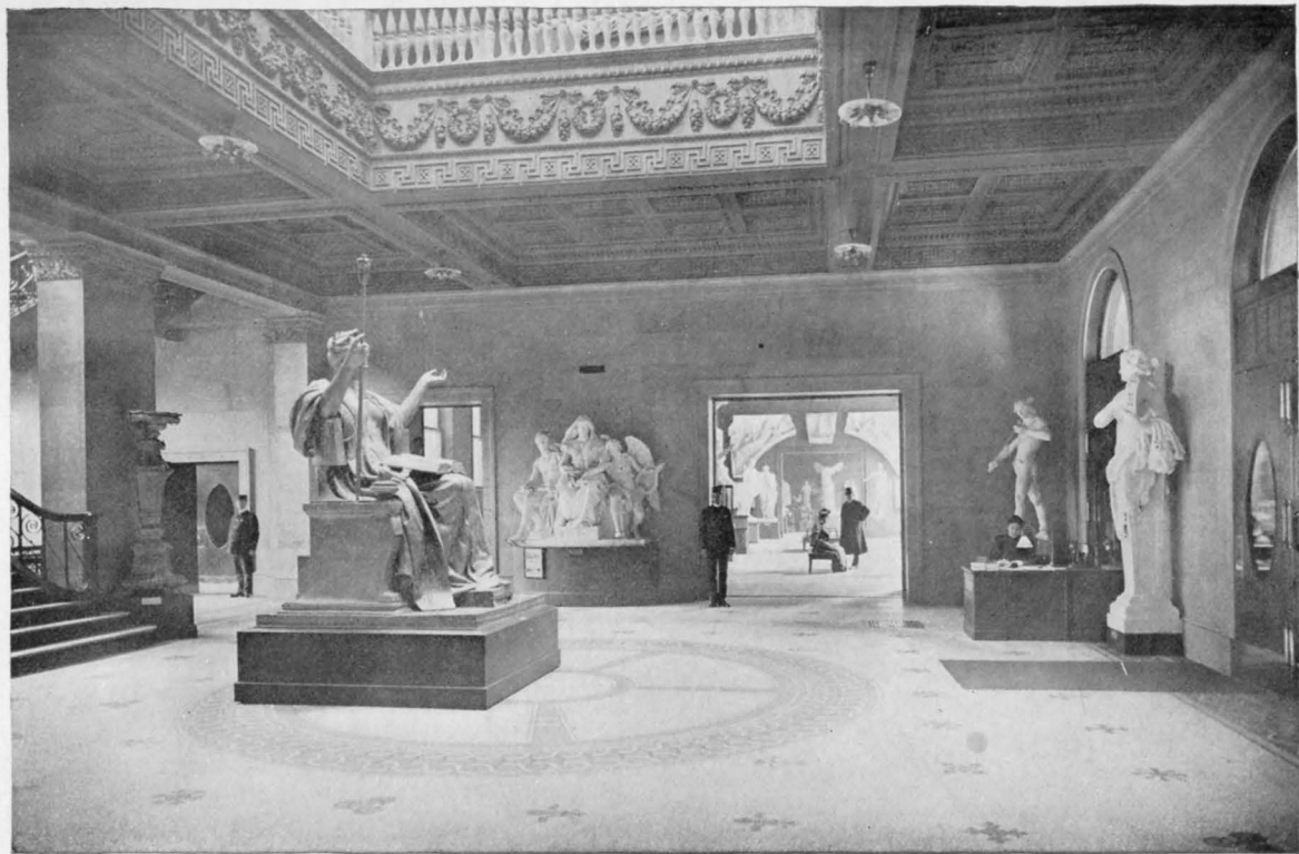
THE ART INSTITUTE. Main Entrance Hall, looking South.