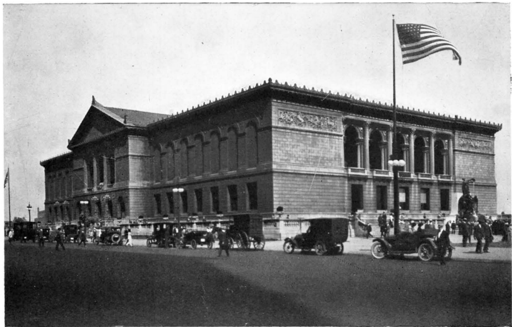
THE ART INSTITUTE OF CHICAGO, Adams Street and Michigan Ave.