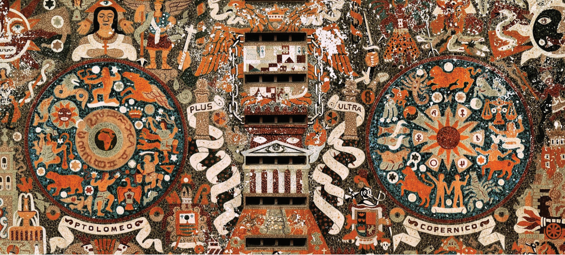
Facade of the Central Library of the National Autonomous University of Mexico.