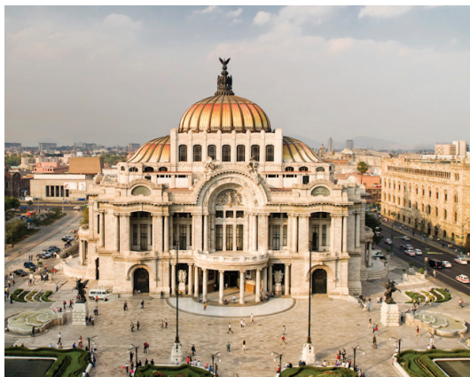
Palace of Fine Arts.