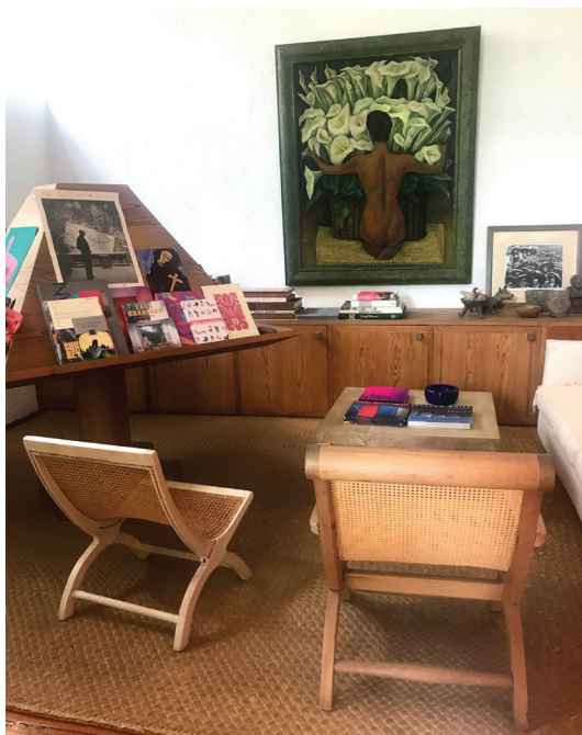
Casa Gálvez.