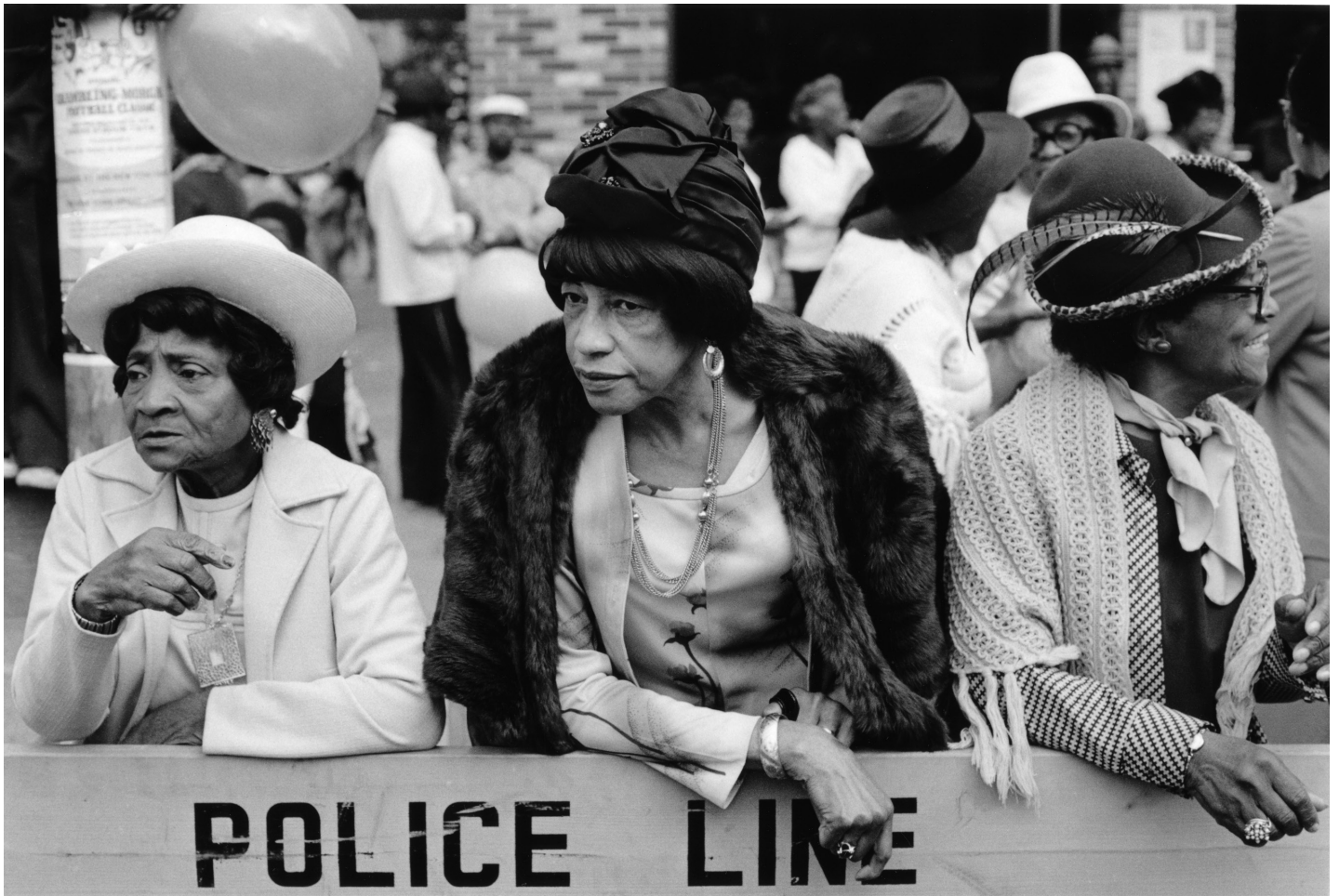
Harlem, NY 1978, printed 2010