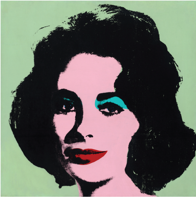
Andy Warhol Liz #3 [Early Colored Liz] 1963

Who is the figure behind this recognizable face?