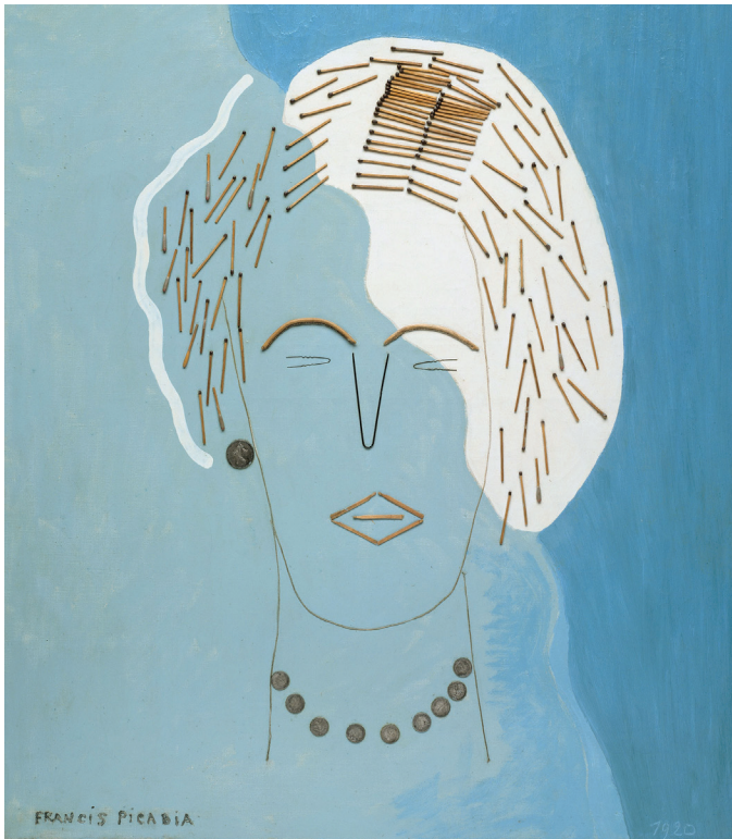
Francis Picabia Untitled (Match-Woman I) 1920

This artwork is made from some really unique materials.