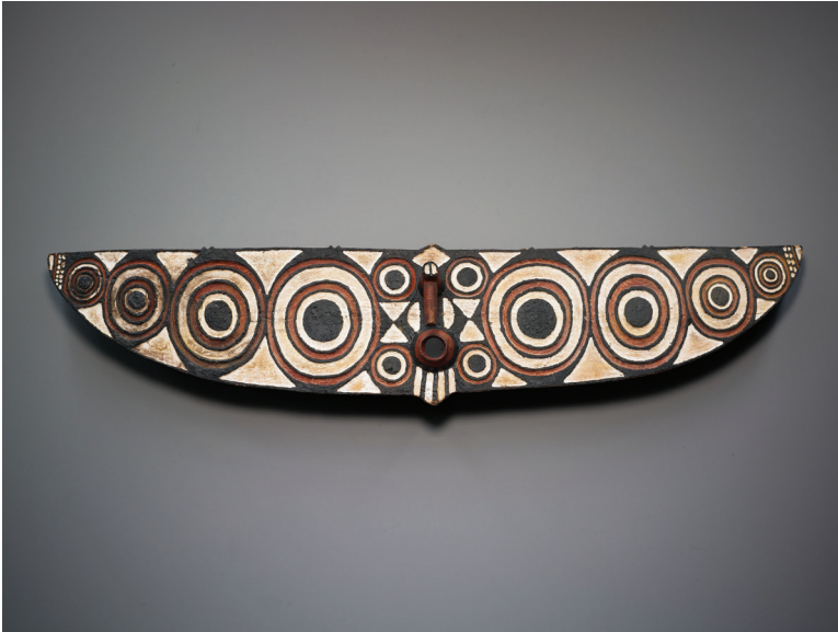
Plank Mask Bwa people; Dossi, Burkina Faso early/mid-20th century

Artworks in the museum range from teensy tiny to supersized.