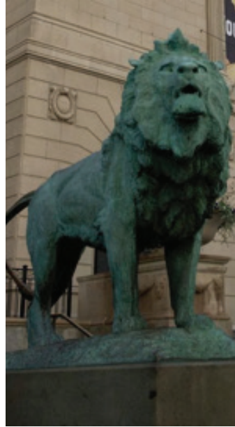
Edward Kemeys Lions (South and North Pedestal) 1893